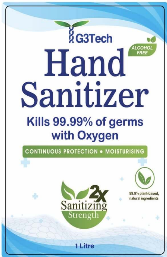
Label sticker 80mm x 125mm _1 Litre Front