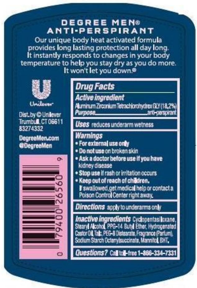
Twin 2.7 oz sleeve