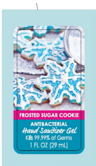
BACK ADHESIVE SIDE