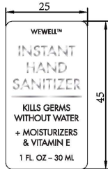
FRONT LABEL CLEAR STOCK