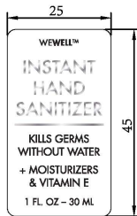
FRONT LABEL CLEAR STOCK