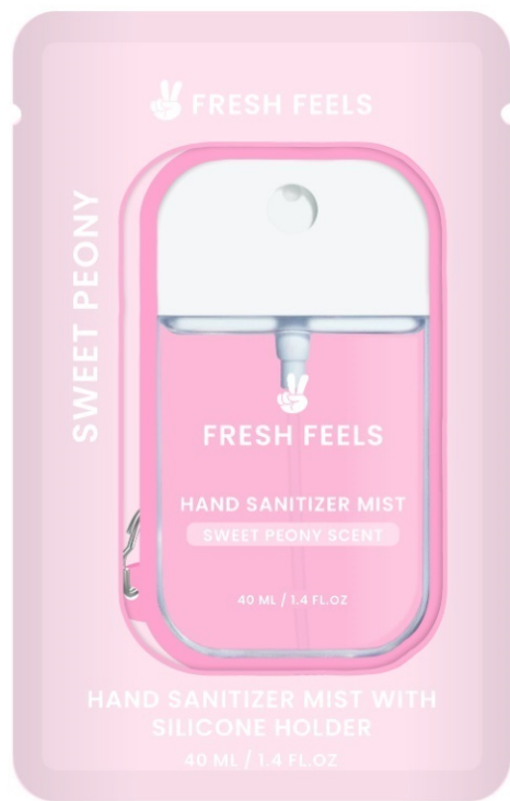
Outer Package Label