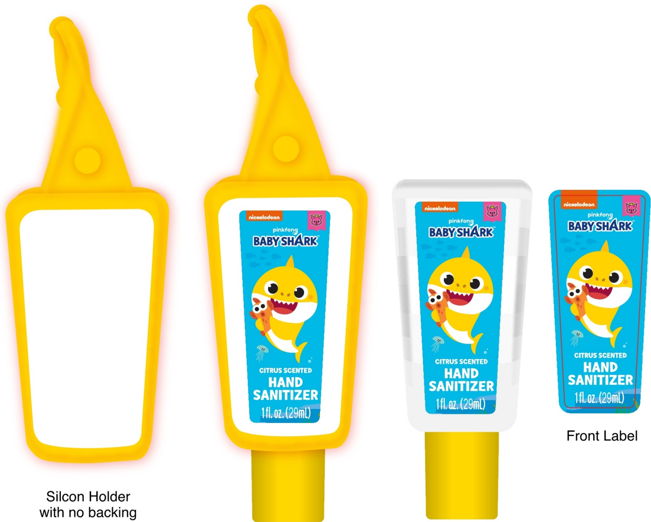
Silicon Holder with no backing