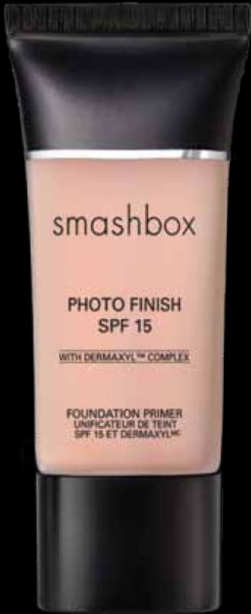
PHOTO FINISH FOUNDATION PRIMER SPF 15 WITH DERMAXYL™ COMPLEX UNIFICATEUR DE TEINT SPF 15 ET DERMAXYL MC