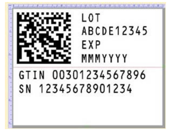
Representative Carton Serialization Image