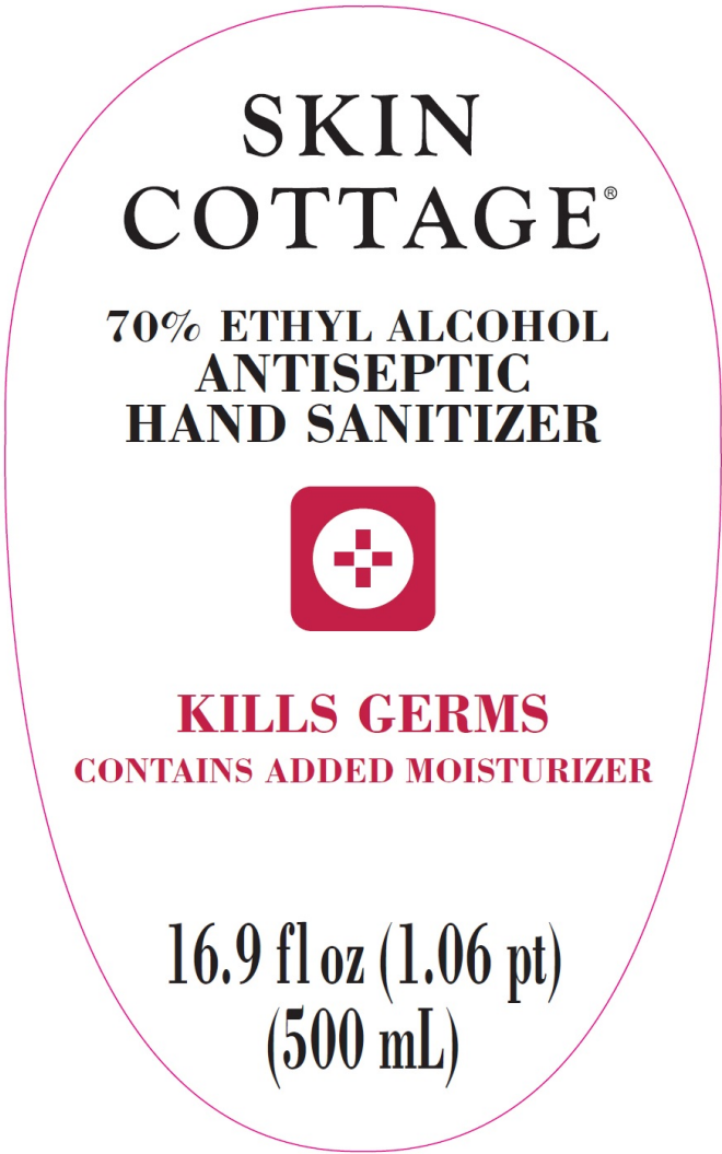
Size Front: 50mm X 80mm

KR SKIN COTTAGE Hand Sanitizer 70% (label)