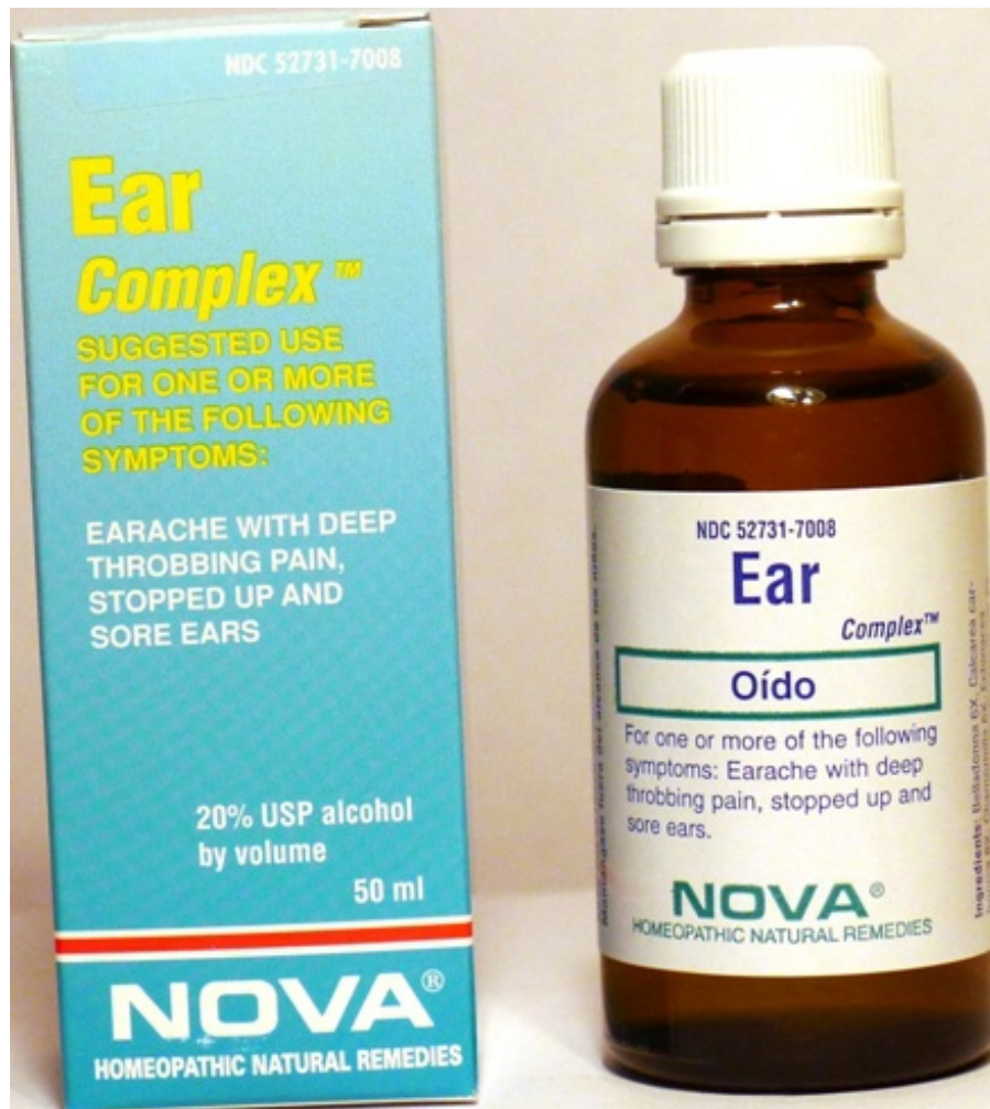
Ear Complex Bottle Label