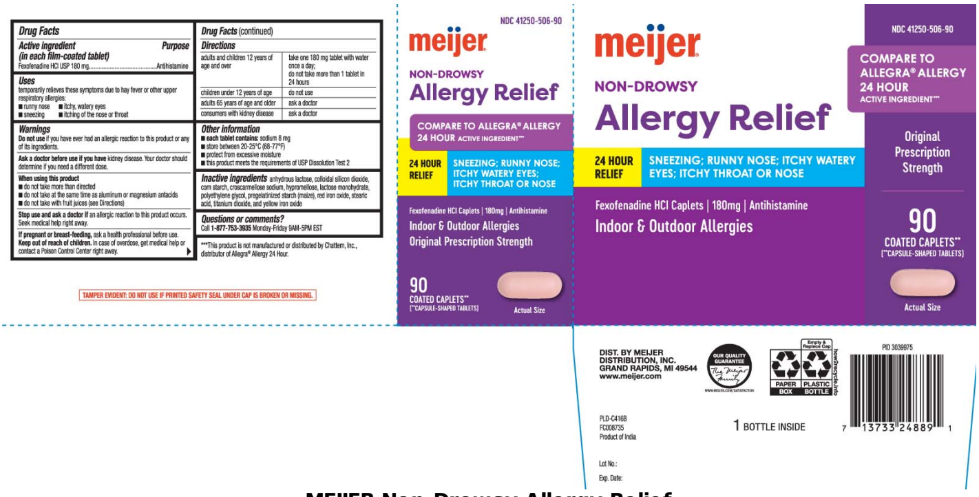
MEIJER Non-Drowsy Allergy Relief