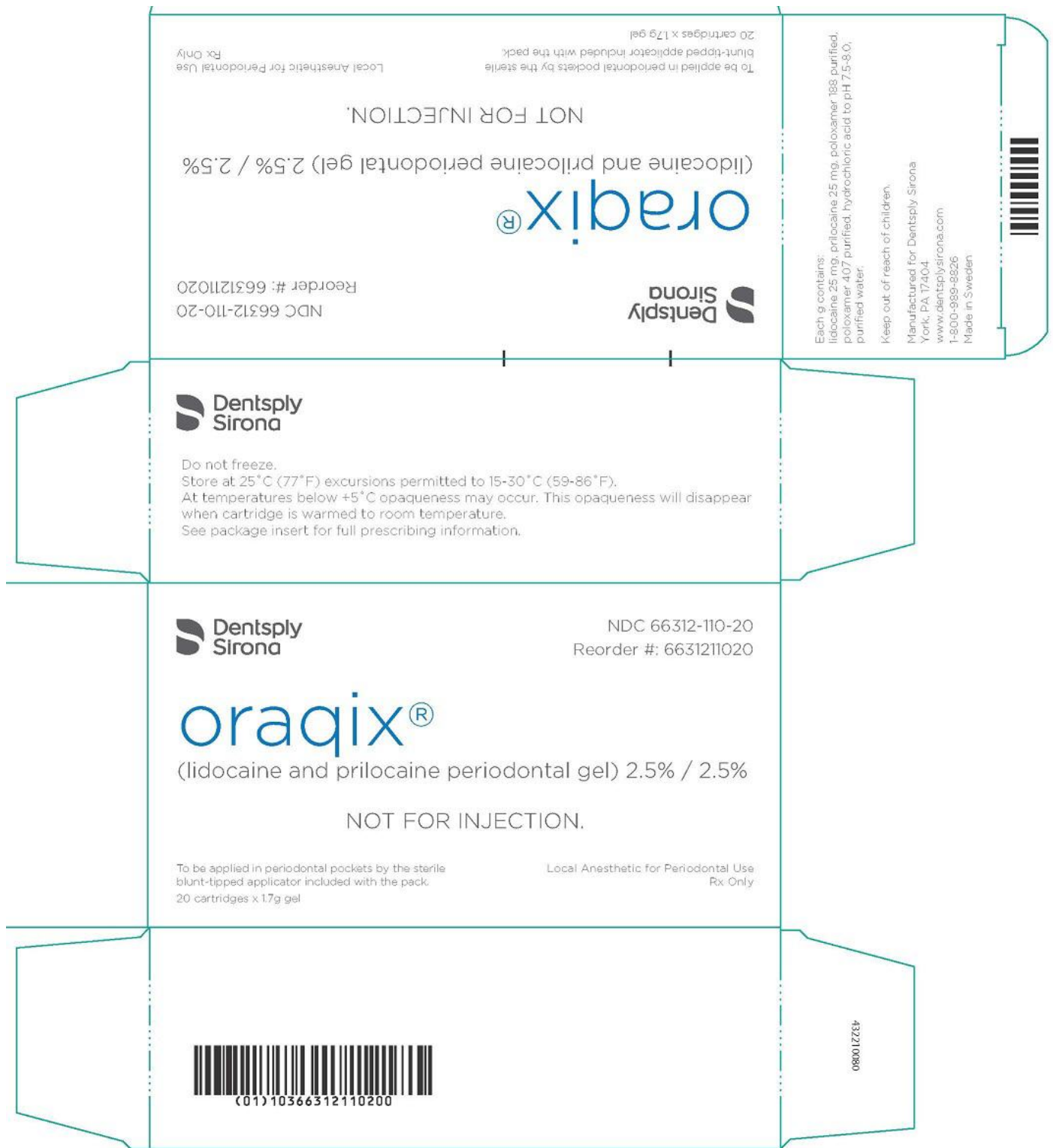
Principal Display Panel - Dispenser Carton