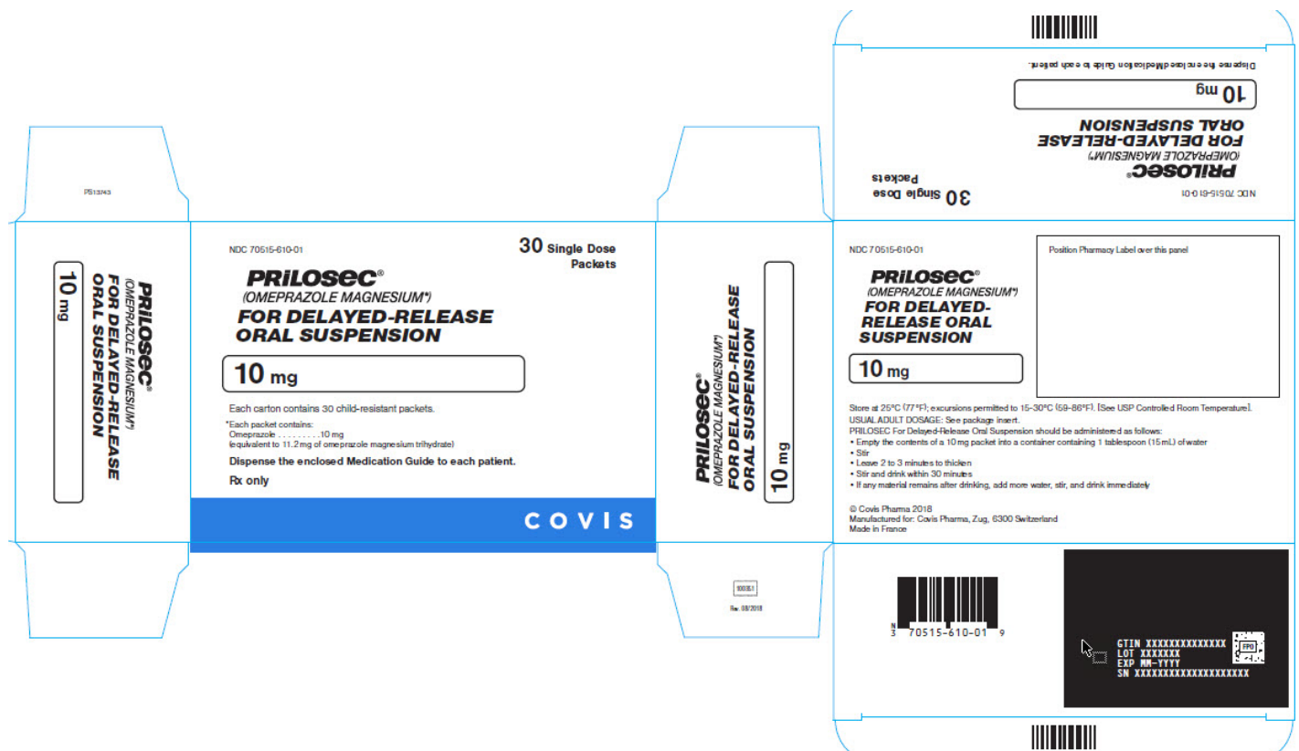
10 mg Carton Label