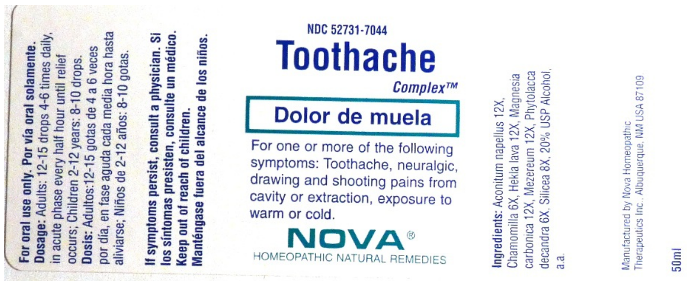
Toothache Complex Box