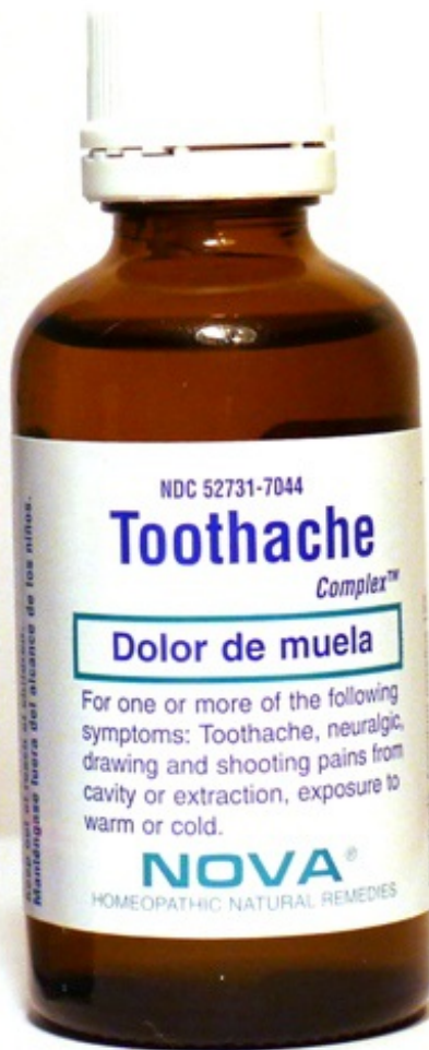
Toothache Complex Bottle Label