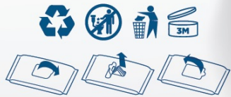
Package Labeling:400 Wipes