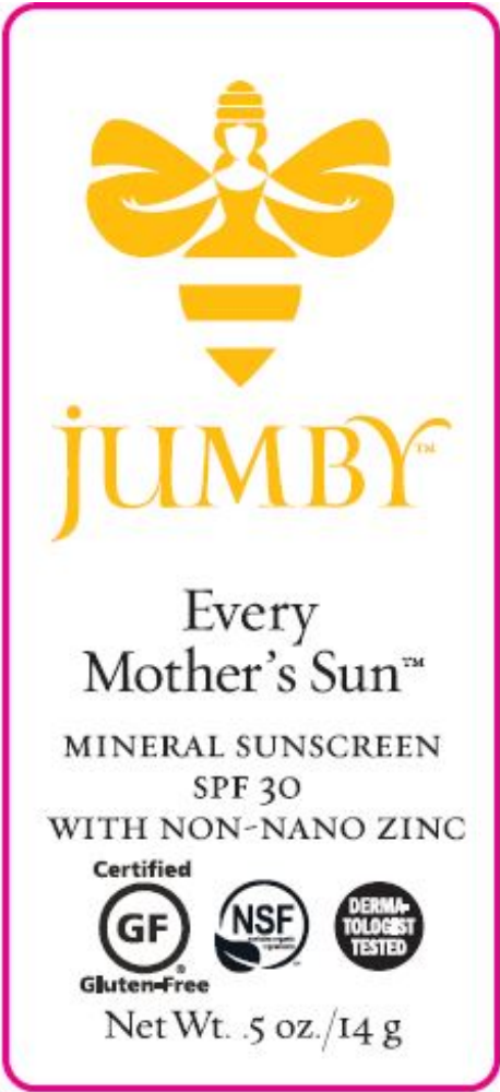
ARTWORK - BACK LABEL