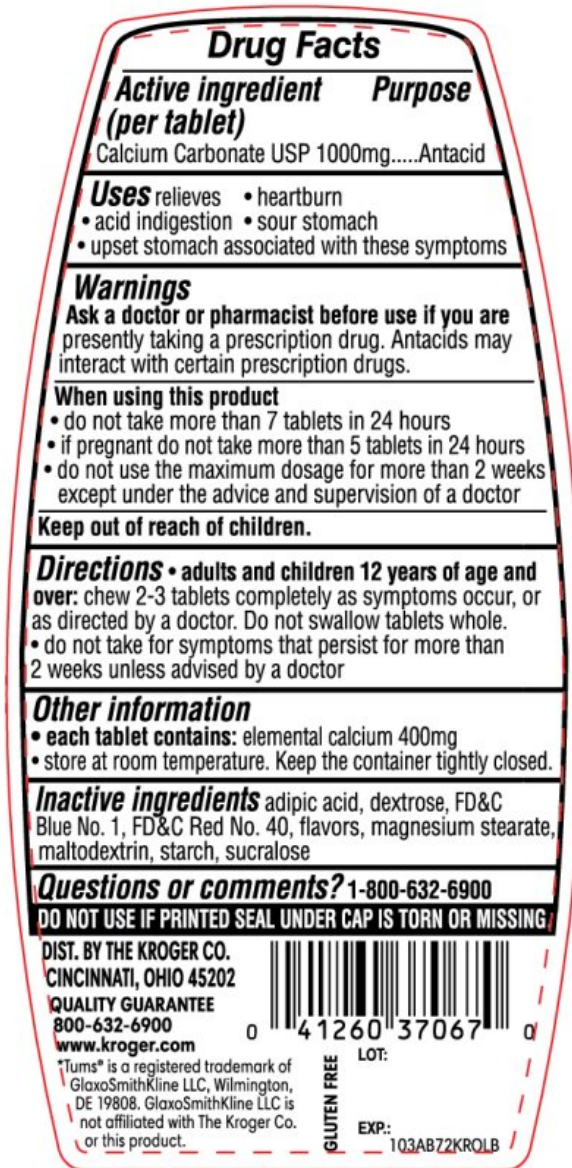
Package Label Twin Pack 160 Chewable Tablets