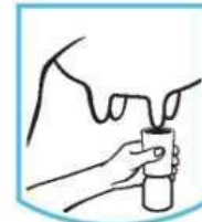
Teat Dip Baño de tetina

Read other label for directions for use, first aid and precautionary statements Lea la otra etiqueta para direcciones de uso, primeros auxilios y medidas preventivas