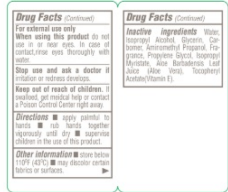
LABEL SIZE: 2.0472" X 1.1811" WHITE BOPP BACK LABEL INSIDE