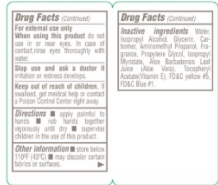
LABEL SIZE: 2.0472" X 1.1811" WHITE BOPP BACK LABEL INSIDE