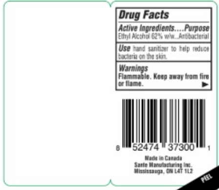
LABEL SIZE: 2.0472" X 1.1811" WHITE BOPP BACK LABEL FRONT