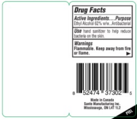
LABEL SIZE: 2.0472" X 1.1811" WHITE BOPP BACK LABEL FRONT