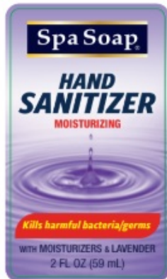
LABEL SIZE: 2.0472" X 1.1811" SEMI-GLOSS PAPER FRONT LABEL