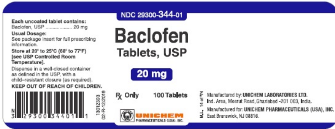
Bottle Label of Baclofen Tablets USP, 20 mg - 100s