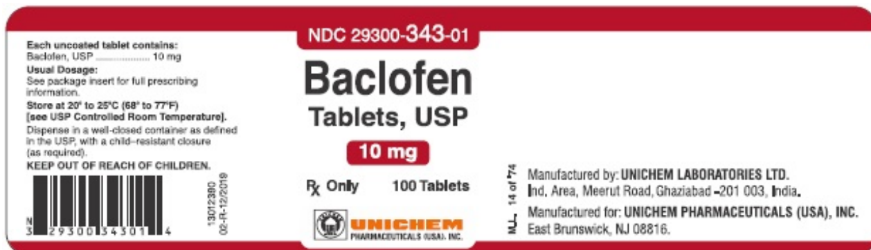
Bottle Label of Baclofen Tablets USP, 10 mg - 100s