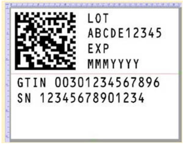
Representative Carton Serialization Image