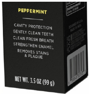
Inner Package Label