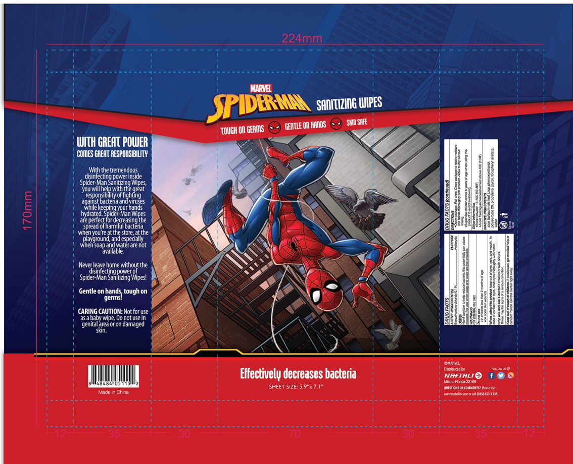
10 solution in 1 package 80593-007-03