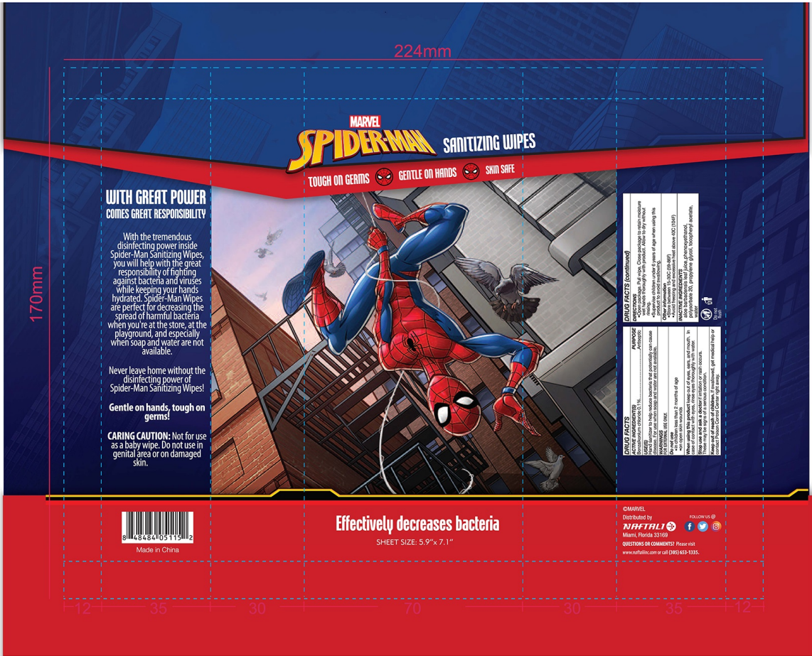
20 solution in 1 package 80593-007-06