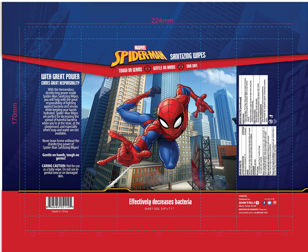
10 solution in 1 package 80593-007-02