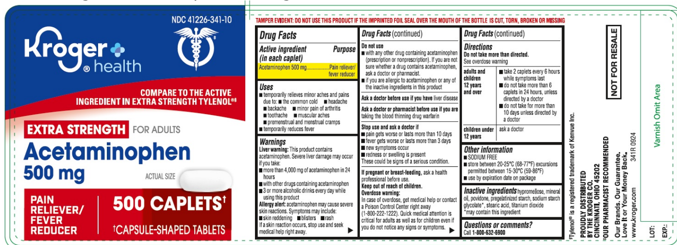
341R- Kroger Acetaminophen 500mg 500ct label