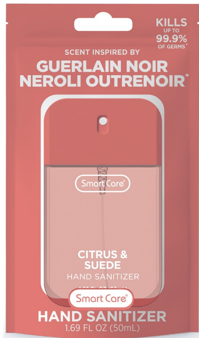
Inner Package Label