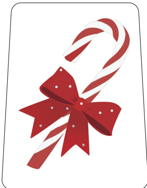
Adhesive goes on top of image