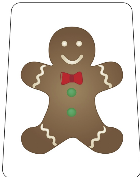
Adhesive goes on top of image