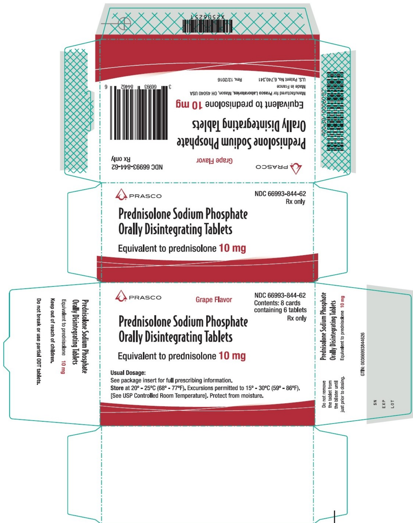
15 mg Carton Prasco