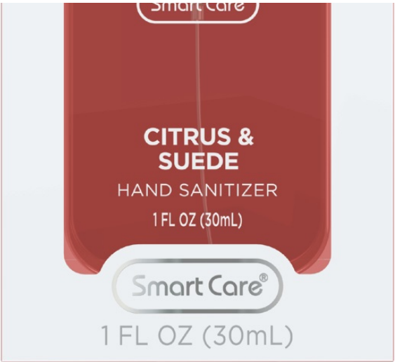
Inner Package Label