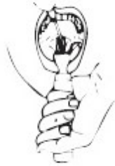
Figure 2. Laryngoscopist's view showing cannula in place in adult larynx and trachea, with black guide mark just proximal to cords.

8. Hold injector in manner of holding a pen, and insert tip of cannula between vocal cords and into trachea to the proper depth for instillation of local anesthetic. The black guide mark is positioned just proximal to vocal cords. At this depth, interior of larynx will be bathed with anesthetic solution from upper jet orifices and entire tracheal wall by lower jet openings. (NOTE: Black mark on cannula shaft indicates approximate depth for insertion in most normal patients without touching carina with distal tip.) Caution and gentleness during insertion should be observed and the cannula advanced a proportionately shorter distance in those persons suspected of having a high tracheal bifurcation or tracheobronchial anomaly. USE CAUTION WITH LARYNGOSCOPE TO AVOID POSSIBLE CANNULA BREAKAGE.