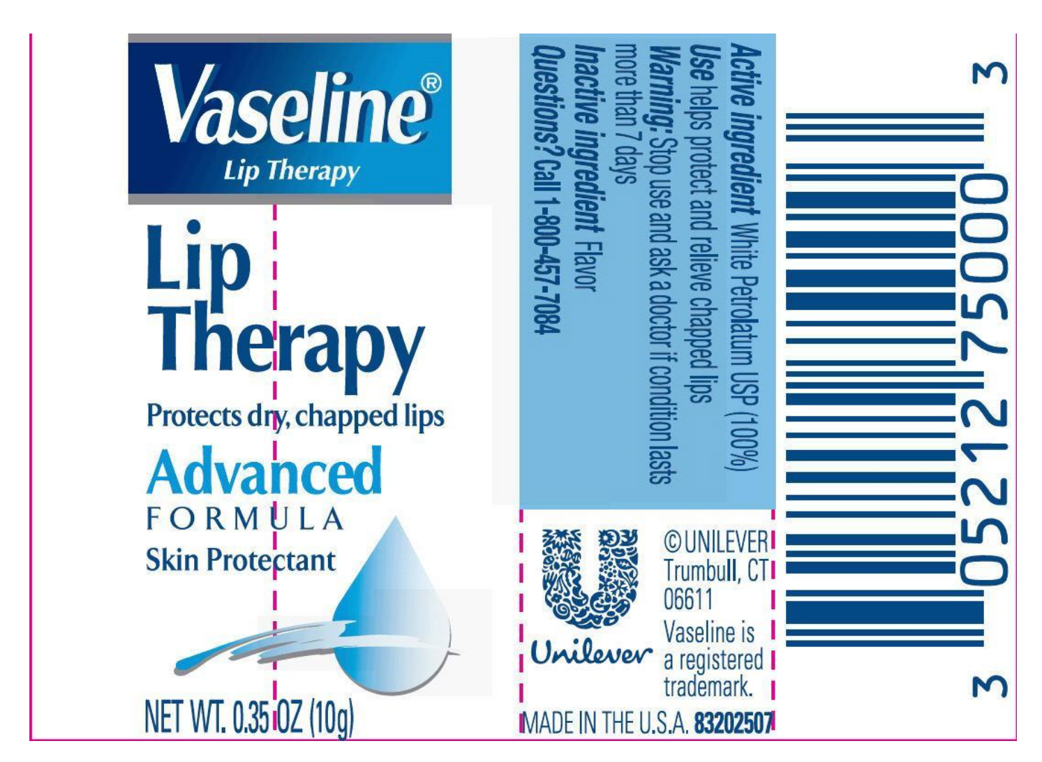
VLT blister card