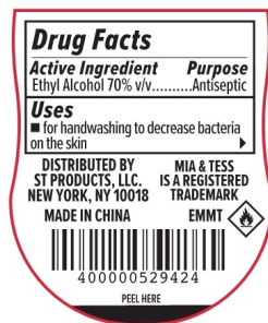
outside front panel