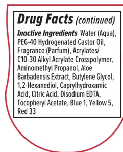
outside right panel