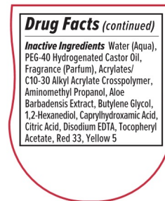
outside right panel 5