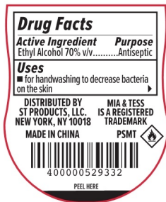
outside front panel 1