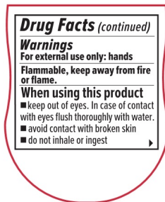
inside left flap 2