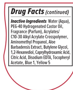
outside right panel