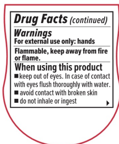
inside left flap