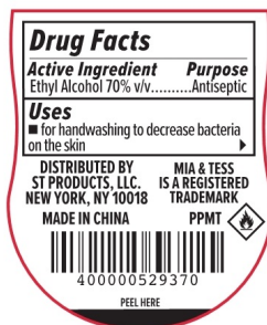
outside front panel