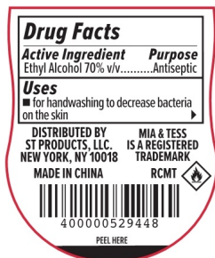
outside front panel