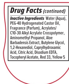
outside right panel