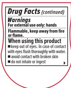
inside left flap