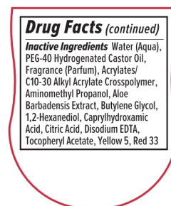
outside right panel 5