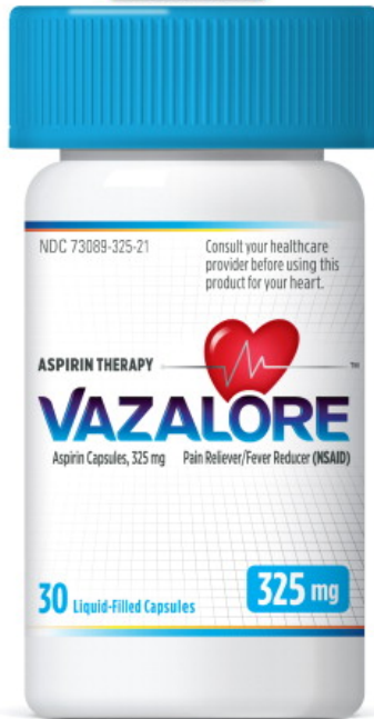
BOTTLE SHOWN ACTUAL SIZE