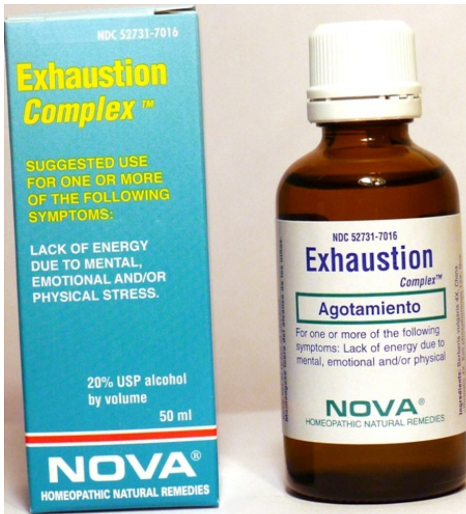
Exhaustion Complex Bottle Label