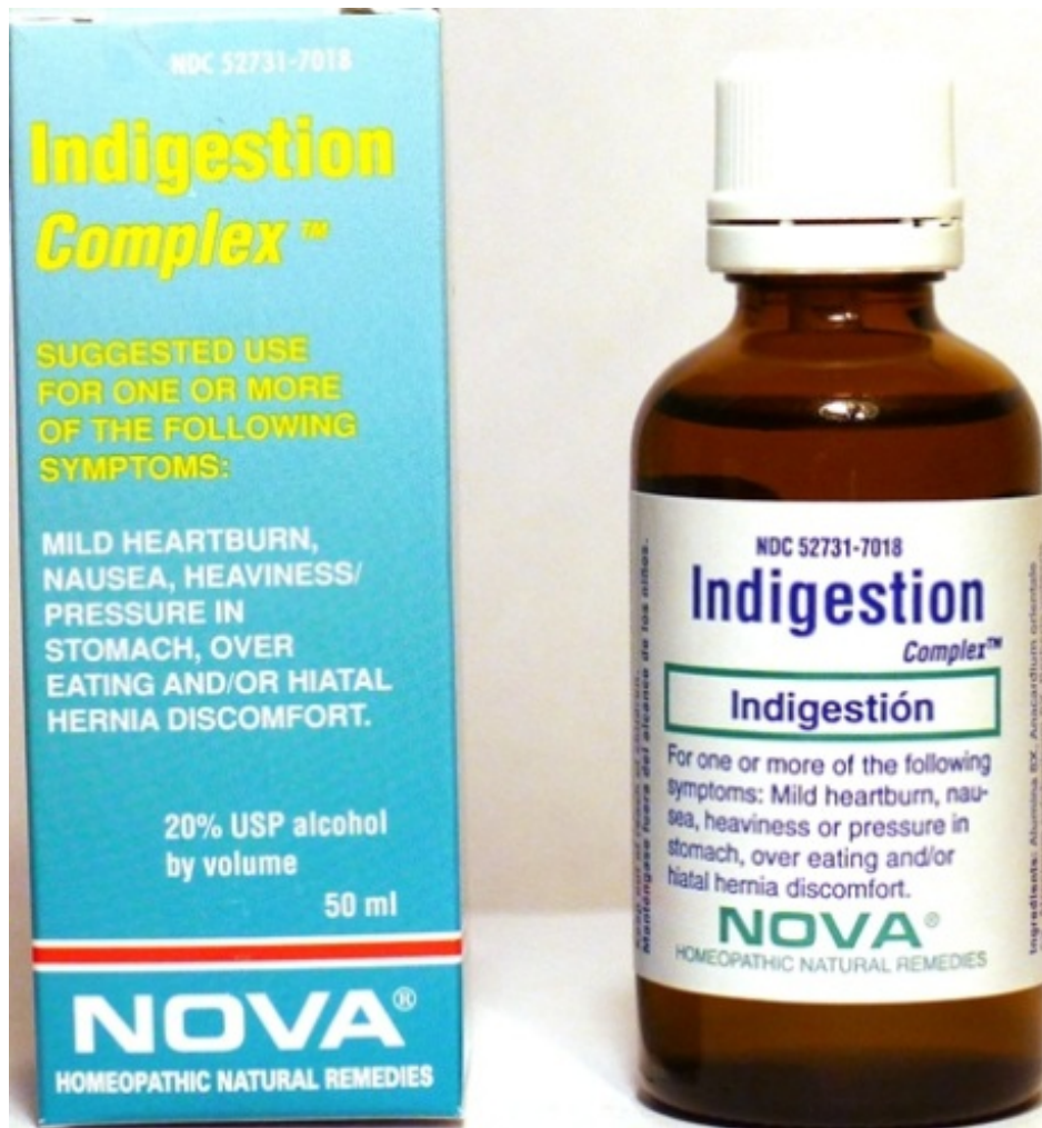
Indigestion Complex Bottle Label