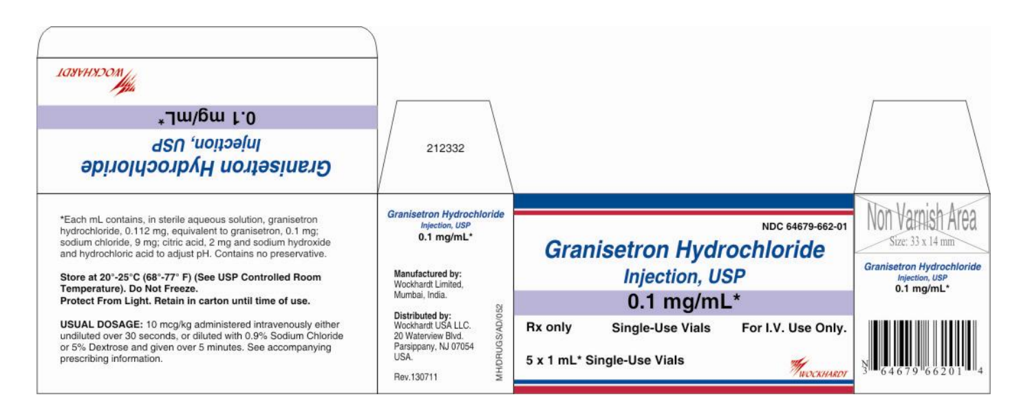
QTY: 5 x 1 mL Signle-Use Vial Carton