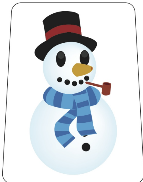
Adhesive goes on top of image