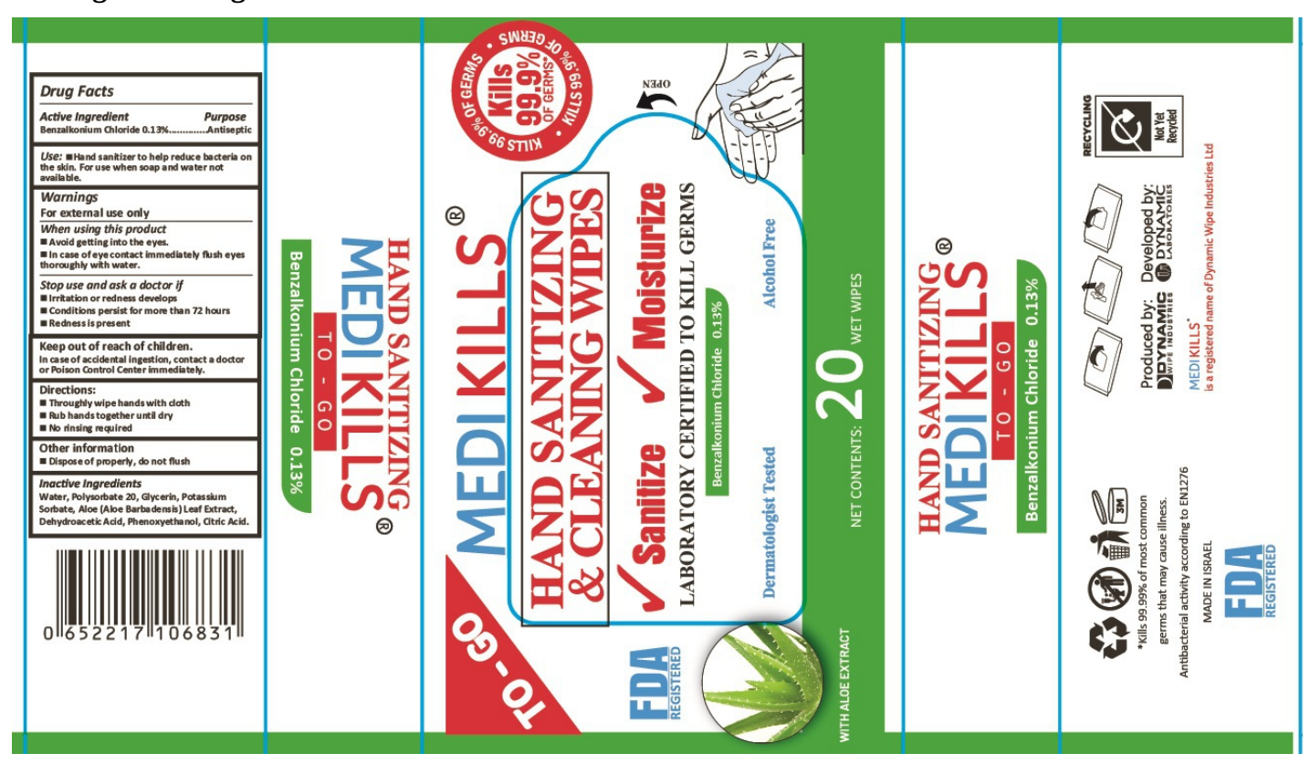
Package Labeling:50 count