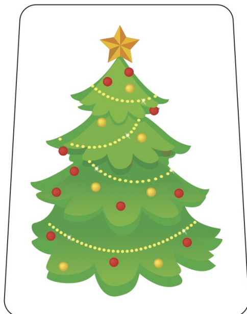
Adhesive goes on top of image