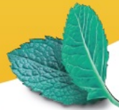
Cool Mint flavor