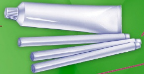
3 Disposable Applicators