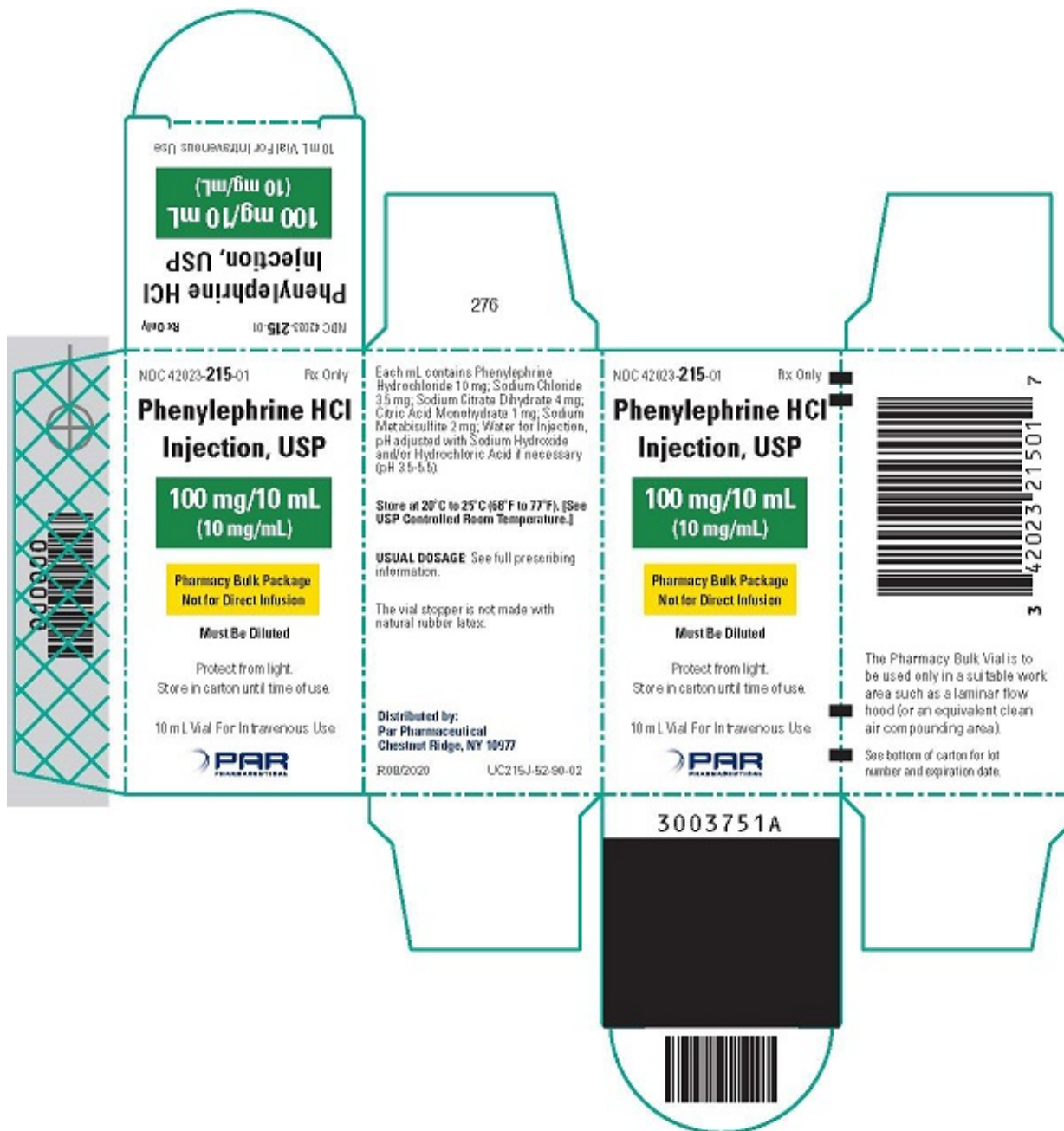
10 mL vial carton