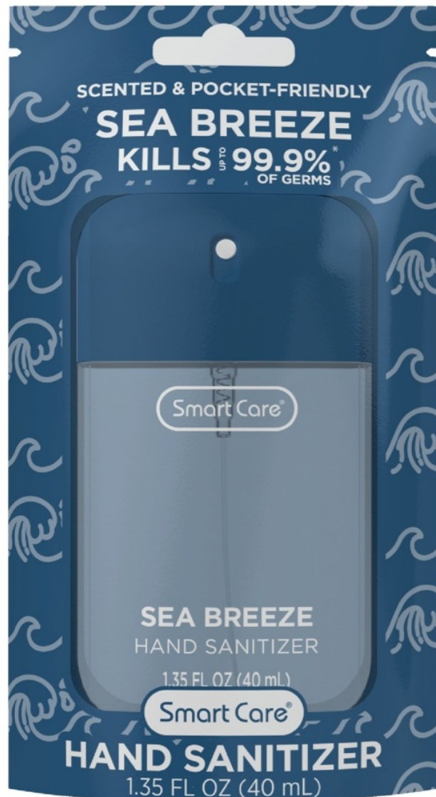
Inner Package Label