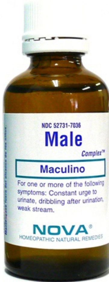
Male Complex Bottle Label