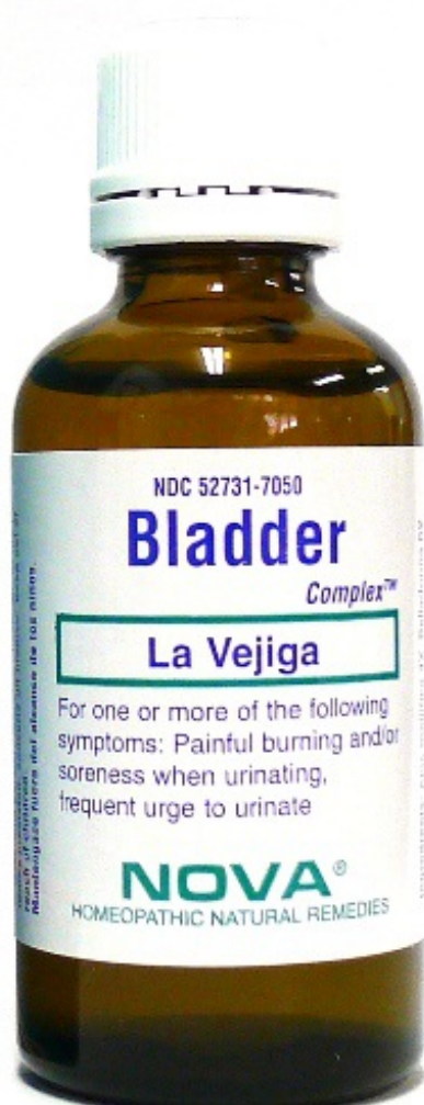
Bladder Complex Bottle Label