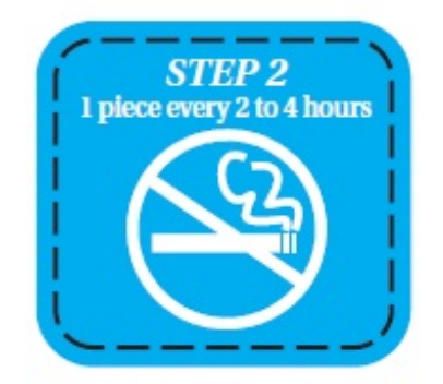
At the Beginning of Week #7